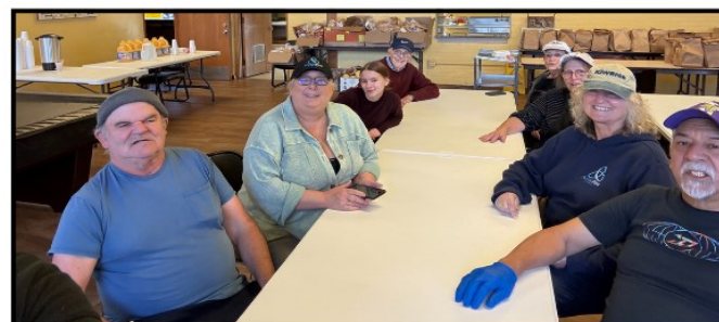
Photo of volunteers from November 30 2024

Hope to see you at one or more of these opportunities to participate in hands-on ministry!